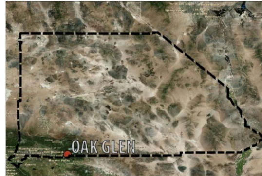
Figure 1: Area Map